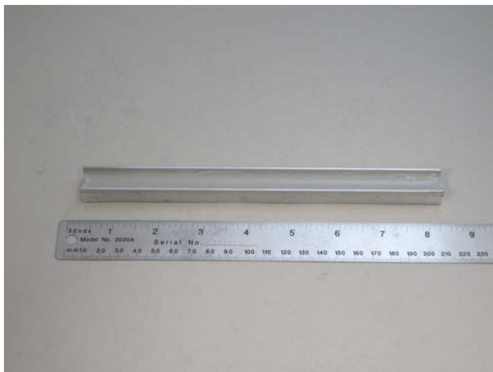
Photo Documentation – The product sample specimen is photographed immediately following specimen preparation and prior to initiating the conditioning period. Typically, the top and bottom faces of the specimen are photographed. Bottom faces may show a stainless steel plate or other substrate if prescribed by the standard.