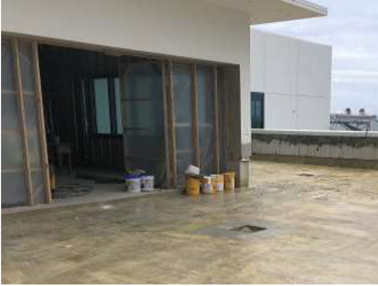
Terrace area primed with Sika Concrete Primer Lo-VOC