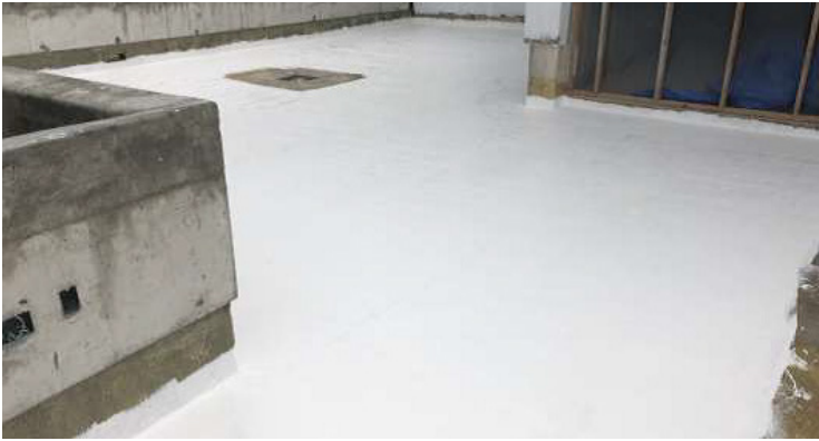
Sikalastic 624 base coat applied on terrace area