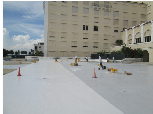
Application of the RoofPro

During the restoration process, all existing overburden materials and original bituminous waterproofing materials were removed. The concrete deck was repaired with Sikaquick® 1000 and Sikaflex® 2C and then primed with Sikalastic® Concrete Primer. All cracks were detailed with Sikalastic® 624 AR resin and Sika® Flexitape Heavy. Sikalastic® 624 AR, an alkaline-resistant waterproofing membrane and flashing, was installed with Sika® Reemat® Premium directly to the primed deck to achieve the most reliable, long-term watertight installation. Once the Sikalastic® RoofPro membrane and flashing installation was complete, new overburden materials were installed to return the promenade and plaza to their former glory. Planter areas were lined with Sika drainage mat and filled with growing media and plantings. The main deck received a layer of Sika drainage mat prior to the installation of a concrete topping slab. Decorative tile was then applied in a cementitious setting bed over the topping slab to create walkways and terrace areas. Following completion of the work, a Sikalastic® RoofPro 20 year materials and workmanship warranty was issued for the Sikalastic membrane installation. The building owners were so pleased with the trouble-free RoofPro application and its leak-free performance following installation that Sikalastic® RoofPro has been selected as the waterproofing for the Biltmore's penthouse terrace areas.