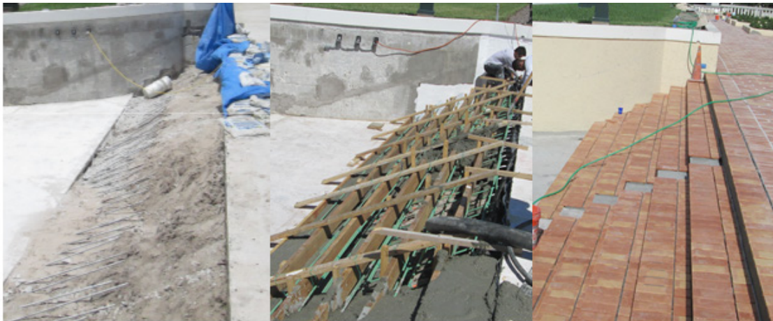
Various stages of Step Repair

Sika® Reemat - a glass fiber matt embedded into Sikalastic® roof coatings for enhanced multi-directional tensile strength. Great for complex details, joints, corners, and protrusions.