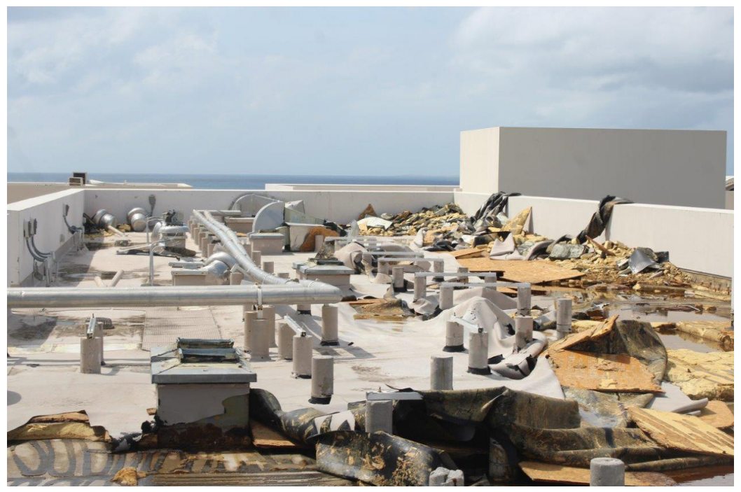
Hurricane damage to EPDM and tapered insulation assembly on roof.

lation would once again be vulnerable to wind uplift forces in hurricane conditions and therefore decided not to replace the failed tapered insulation but instead decided to have the contractors slope the roofs with SikaQuick 1000.