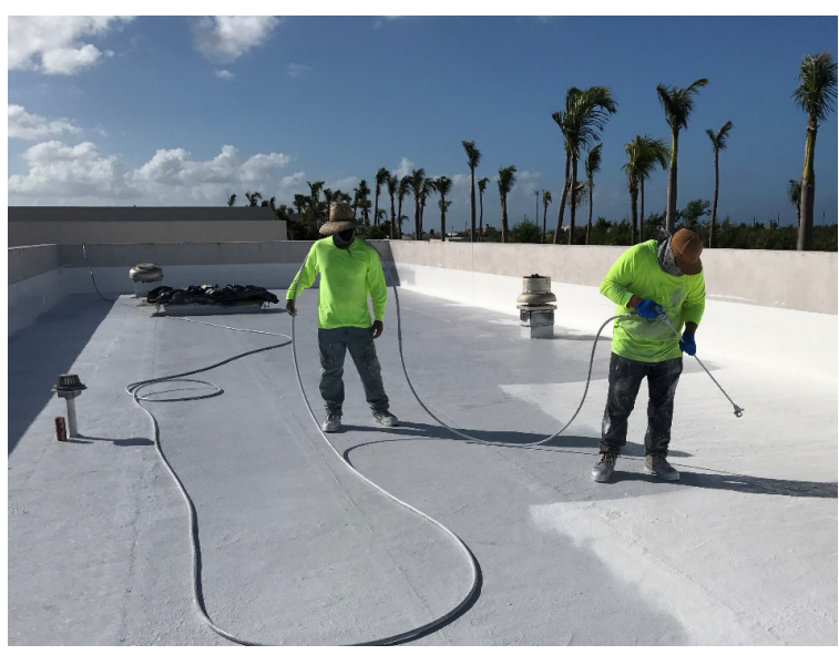
Spray-applying the Sikalastic RoofPro liquid-applied membrane at Four Seasons.

The rapid-setting properties of SikaQuick 1000 allowed the contractors to apply the RoofPro membrane as soon as the next day. In the end, about 75 truckloads of SikaQuick 1000 were shipped from Conyers, GA and 9 truckloads of RoofPro materials were shipped from Marion, OH worth a total of approximately $2.4 million. During a critical path portion of the project schedule at the