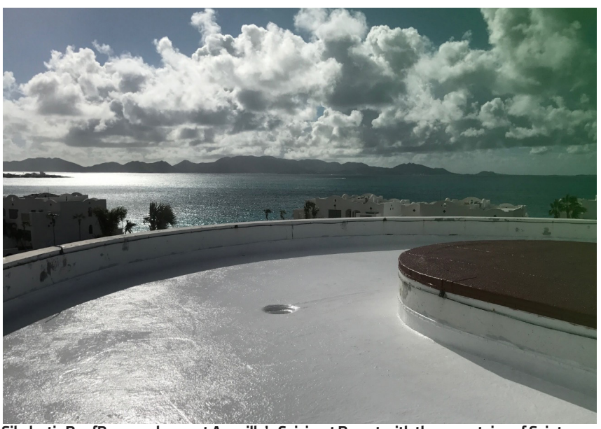
Sikalastic RoofPro membrane at Anguilla's Cuisinart Resort with the mountains of Saint Martin in the background.

Because of the tremendous success of the RoofPro work at the Four Seasons Resort, another ultra-luxury resort on Anguilla also decided to replace their failed roofs with Sikalastic RoofPro. The Cuisinart Resort which is only a few miles from the Four Seasons Resort is currently in the process of applying the RoofPro membrane on 200,000 square feet of roof. To date the Cuisinart Resort has purchased over $940,000 in RoofPro materials and expects to complete their RoofPro work by November 2018.