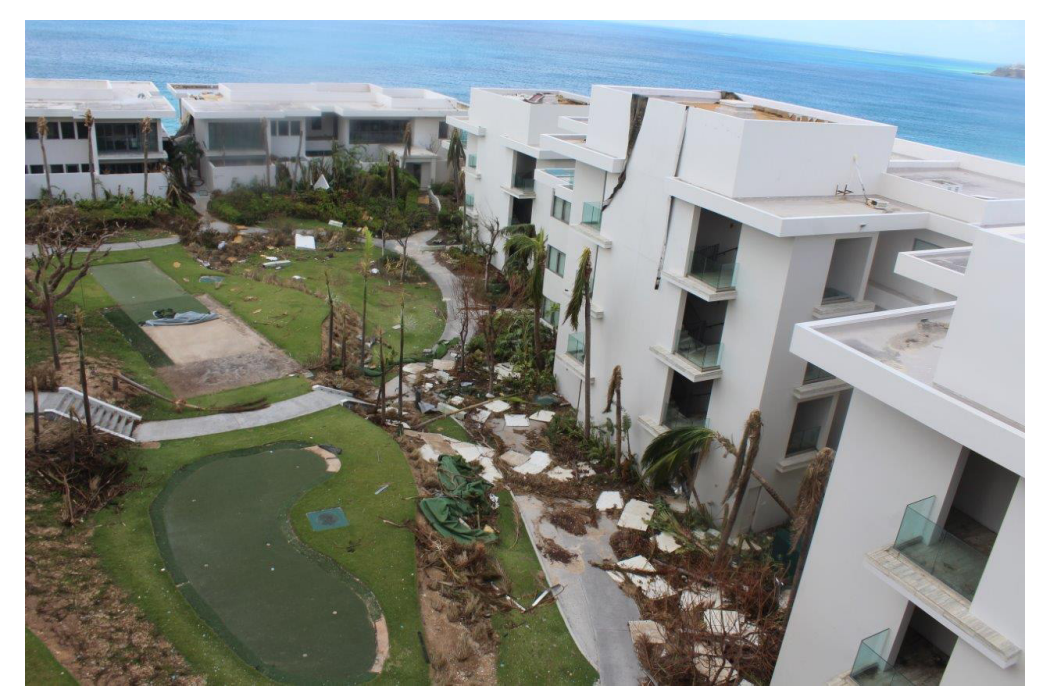
Damage to the buildings at the Four Seasons Resort in Anguilla caused by Hurricane Irma.

On March 23, 2018, 6-1/2 months after Category 5 Hurricane Irma barreled through the tiny Caribbean island of Anguilla (population 15,000) with sustained winds in excess of 185 mph that ripped roofs from buildings, the Four Seasons Resort re-opened its doors and welcomed guests back to its spectacular property.