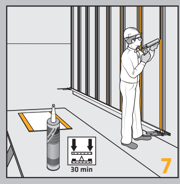
Apply SikaTack® Panel-50 in a triangular bead by using a triangular nozzle (width 8 mm, height 10 mm) with at least 5 mm gap to the fixing tape and to the side of the batten.

Do not pull off the protective foil at this time.