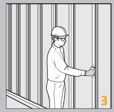
Remove dust with a lint-free paper towel

Ask Sika representative or the panel supplier for specific advice on pre-treatment steps.