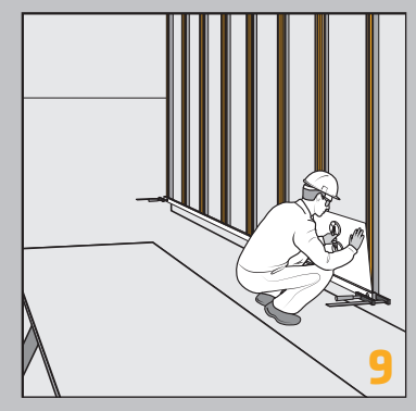
Place the cladding panel in the required position first, without the panel touching the fixing tape. Then, press it firmly until it touches the SikaTack® Panel Tape.