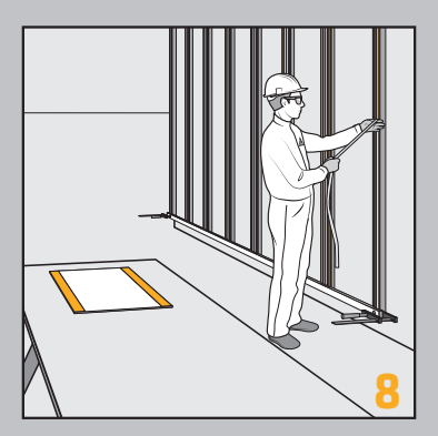
Remove the protective foil on the SikaTack® Panel Tape.