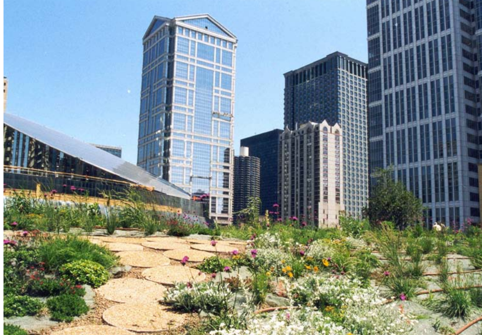
The green roof atop Chicago City Hall immediately began saving the city almost $10,000 per year in energy costs.