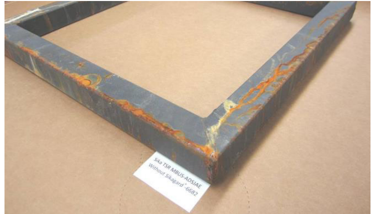
CONTROL TEST FRAME BEFORE (LEFT) AND AFTER (RIGHT) 1000 HOURS SALT SPRAY EXPOSURE