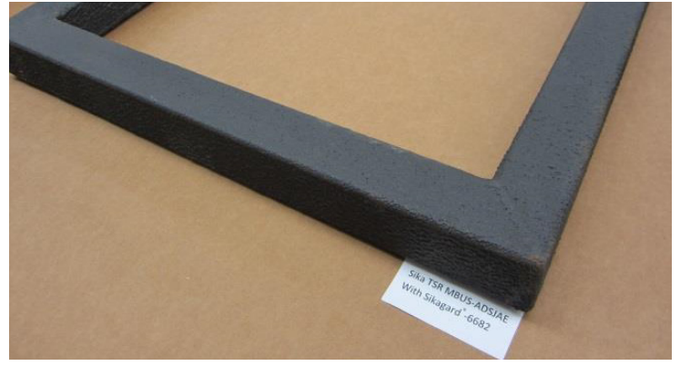
SIKAGARD®-6682 TEST FRAME BEFORE (LEFT) AND AFTER (RIGHT) 1000 HOURS SALT SPRAY EXPOSURE