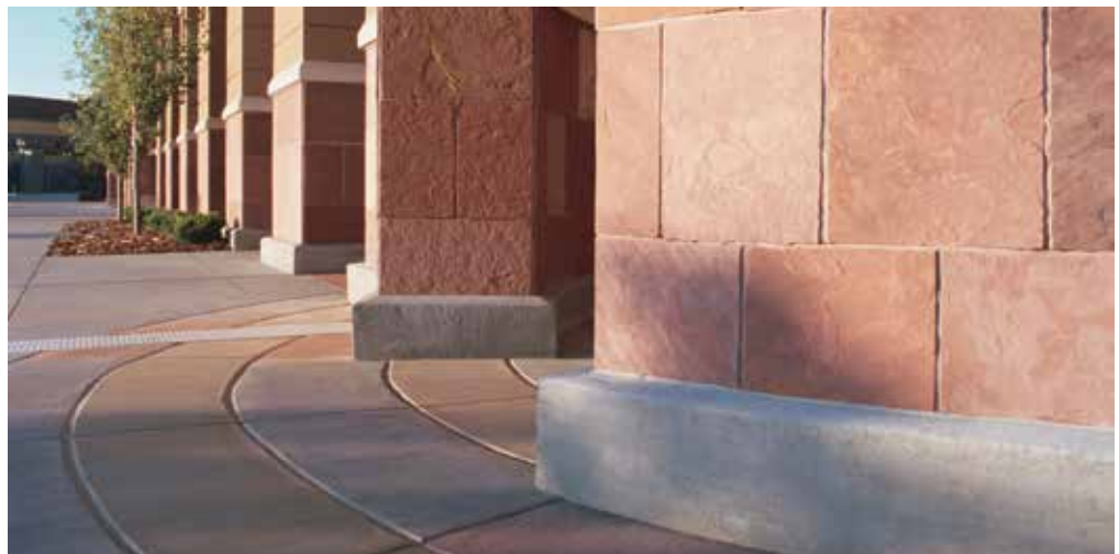
*SCOFIELD® Revive™ Exterior Concrete Stain

■ SCOFIELD® Repello® FPS is a breathable, low visibility, non-flammable surface treatment that provides water and stain repellency to interior or exterior concrete surfaces. It can be used to create surfaces that are compliant to various ANSI, ASTM, NFSI, and UL traction standards. SCOFIELD® Repello® FPS is ideal for food courts, pools, and entrance walkways where maximum stain resistance is required. It renders concrete furniture stain resistant, and can be used on stamped, etched, sand blasted, or surface retarded concrete. Use on cured concrete at least 14 days old. If used over solvent based stain, stain should be allowed to cure a minimum of 12 hours to allow solvents to evaporate. If used over chemical stain or acid etched surfaces, the surface must be neutralized and rinsed thoroughly prior to application of SCOFIELD® Repello® FPS. Low odor, water-based formulation.