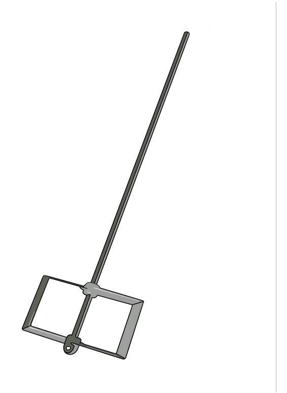
Top: Jiffy Style Paddle Bottom: Mud Mixing Paddle