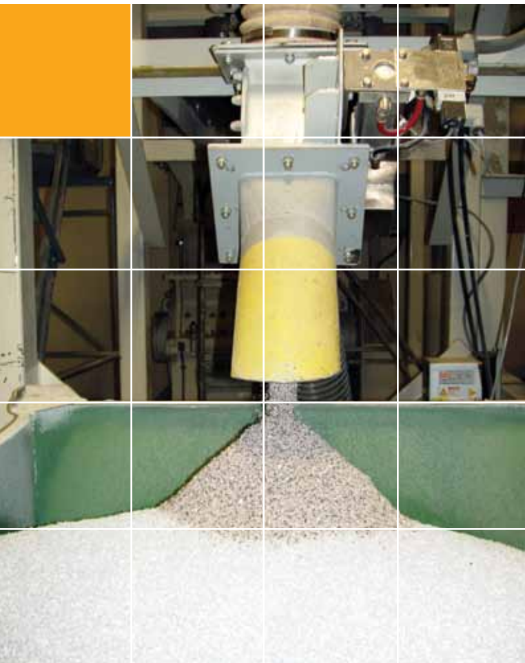
The standard measures recyclability and reclamation of single-ply membranes.

categories. The prerequisite credits are the performance minimum level to claim any conformance level to the standard. Higher achievement levels are obtained by achieving a combination of optional points from each category. Silver, gold and platinum ratings are awarded based on the total number of points achieved.