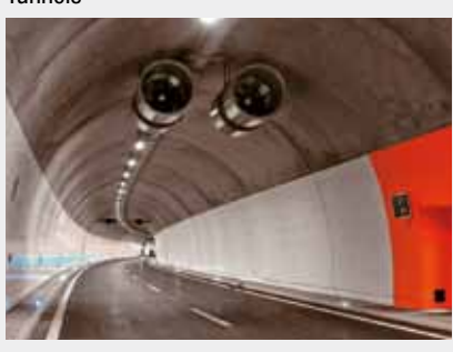
Preferred Sika products: Sikagard<sup>®</sup>-706 Thixo Sikagard<sup>®</sup>-705 L