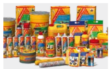
Sika's complete product range complete solutions from one supplier