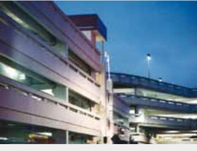
Preferred Sika products: Sikagard<sup>®</sup>-705 L Sikagard<sup>®</sup>-740 W