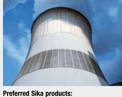
Sikagard<sup>®</sup>-706 Thixo Sikagard<sup>®</sup>-705 L