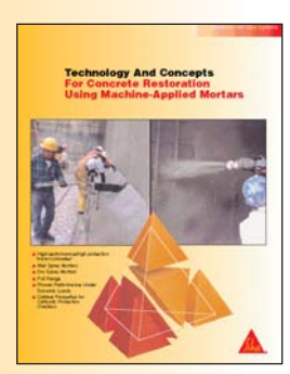
Spray-Applied Repair Mortars