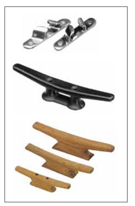
Fig. 76 A selection of cleats that can be sealed or bonded using Sika adhesives

Fig. 75 A port-hatch, both bonded and sealed using Sikaflex®