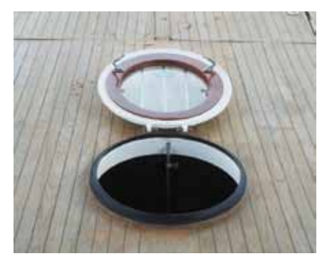
Fig. 75 A port-hatch, both bonded and sealed using Sikaflex®