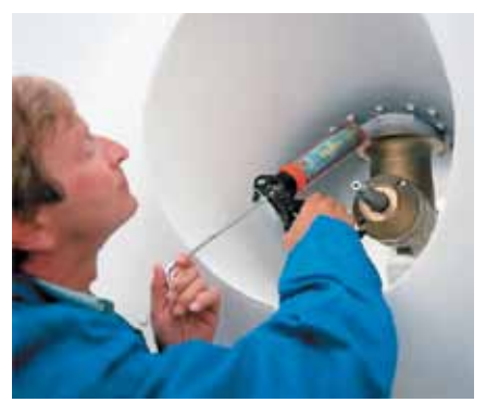
Fig. 74 Applying Sikaflex®-292