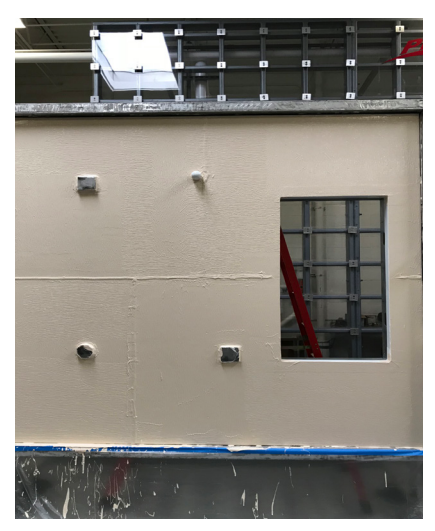
ASTM 2357 Test Panel - Completed