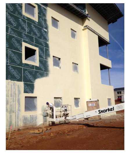
Application of Sikagard® 535