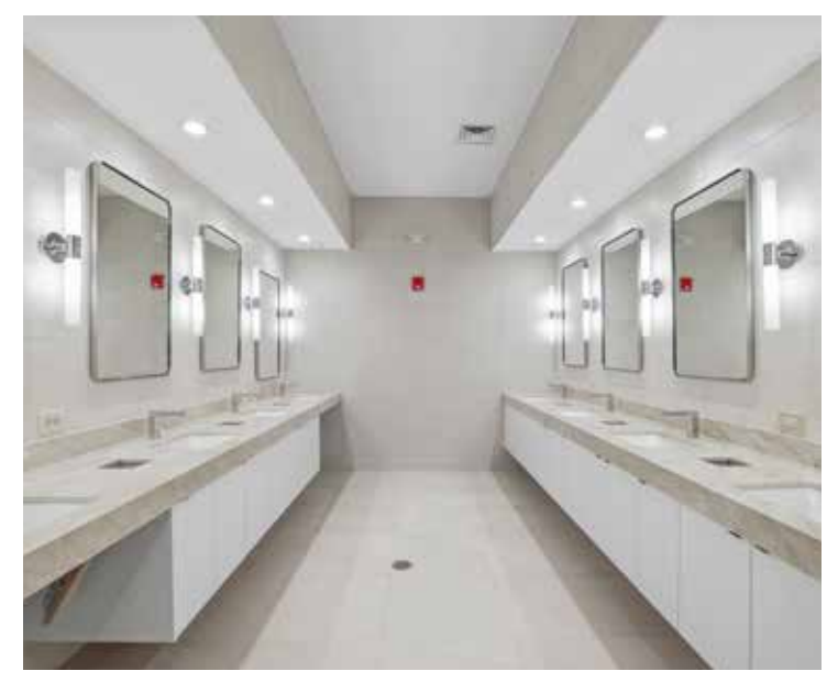
Zaharion's used SikaTile®-475 LHT Premium Set throughout the clubhouse's floors.

"SikaTile®-475 [LHT Premium Set] we used for the lobby for adhesion pur-