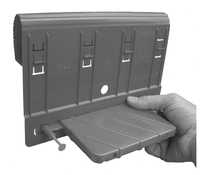
ASSEMBLED SPEED PLATE®

Sika Greenstreak® 3400 Tree Court Ind. Blvd. St. Louis, MO USA