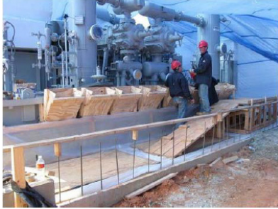
Photo of several headboxes used to facilitate flowing epoxy grout across a large baseplate.*

Material used for caulking between the form and concrete surface may be a stiff consistency of sand-cement mixture or stiff consistency of the grout to be used. Some contractors will use a silicone product which can be extruded from a tube (with a consistency of toothpaste) and by squeezing this tube lay a bead of caulk along the joint to be tooled, or pushed into the crack with a finger. Where caulking might be architecturally unattractive, after form stripping, or in cases where organic or silicone products are used and cause a void in, or loss of bond of the “shoulder” grout next to the form location, caulking should be done on the outside edge of the form rather than the inside.