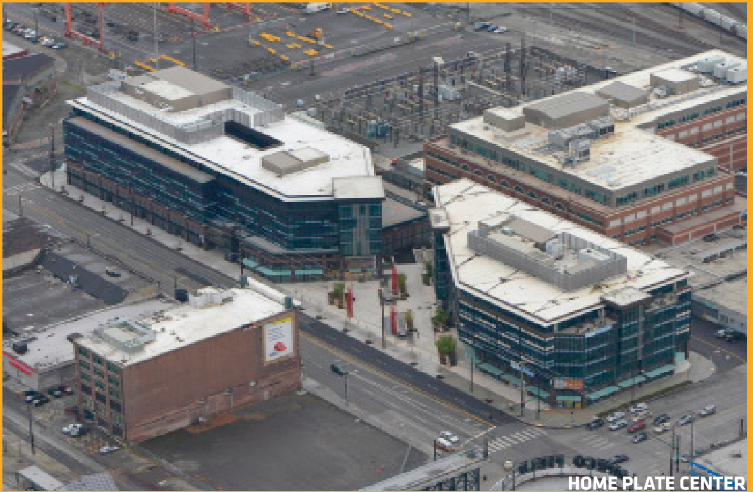
HOME PLATE CENTER