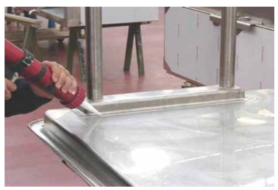
Fig. 87 Metal table legs are bonded and sealed to a metal table-top using Sikaflex®-292

Always refer to the current Sika Product Data Sheets and Material Safety Data Sheets obtainable through your local Sika Company