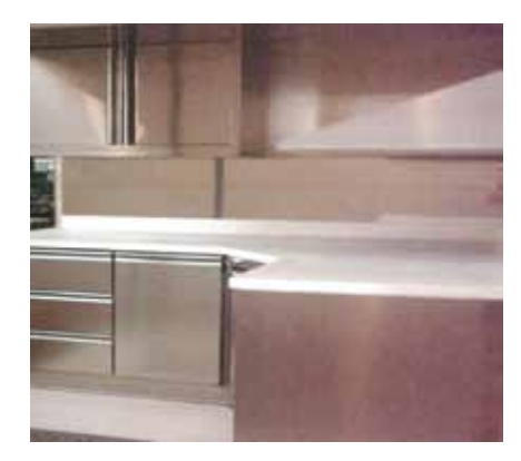
Fig. 84 A galley work surface fitted using Sikaflex®