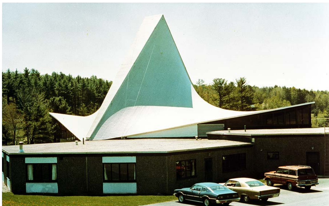
Figure 4: A thermoplastic PVC cool roof was installed on the First United Methodist Church in Gilford, New Hampshire in 1976 and is still in service today, 38 years later.

The LBNL laboratory study is a high level, macro assessment of the potential energy and environmental benefits of cool roofs across the entire USA. Engineers at the HVAC & R Center & Industrial Refrigeration Consortium at the University of Wisconsin (UW) at Madison, on the other hand, were specifically interested in the impact of cool roofs in the cities of Minneapolis, MN and Denver, CO. Their study was based on a typical “big box” retail building. They simulated different combinations of roof colors (black, white), roof insulation values (from none to R24), with and without accounting for snow cover.