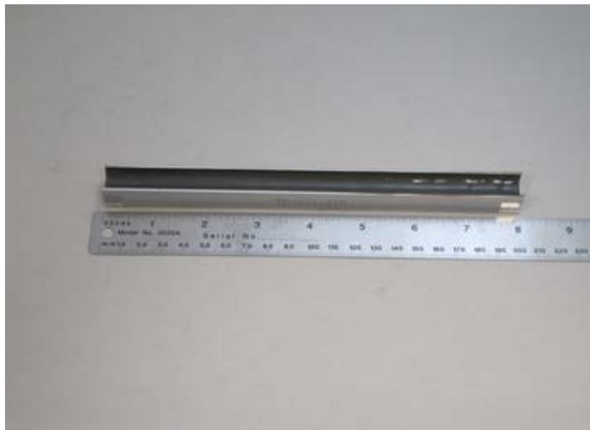
Photo Documentation – The product sample specimen is photographed immediately following specimen preparation and prior to initiating the conditioning period. Typically, the top and bottom faces of the specimen are photographed. Bottom faces may show a stainless steel plate or other substrate if prescribed by the standard.