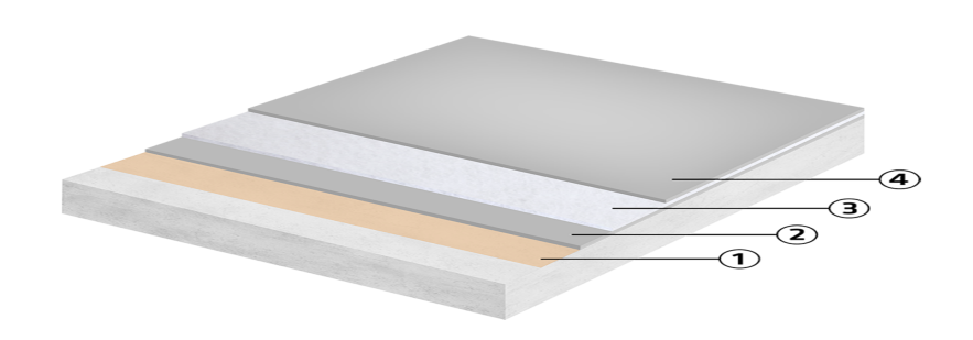
Sikalastic® -641 Lo-VOC System Guide with Sika® Fleece