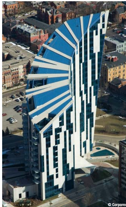
The distinctive Ascent at Roebling's Bridge will serve as a landmark in the Covington - Cincinnati area for years to come.

"It was a real team effort figuring out how to build the bands and deal with the steep conditions and complicated geometry of this