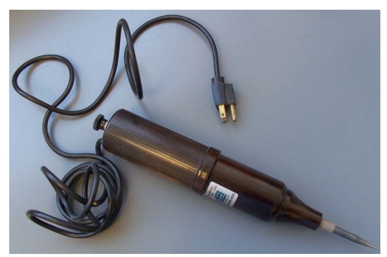
Figure 5: Holiday Spark Tester

Sika Greenstreak sells Spark Testers for approximately $350, shown in the figure below: