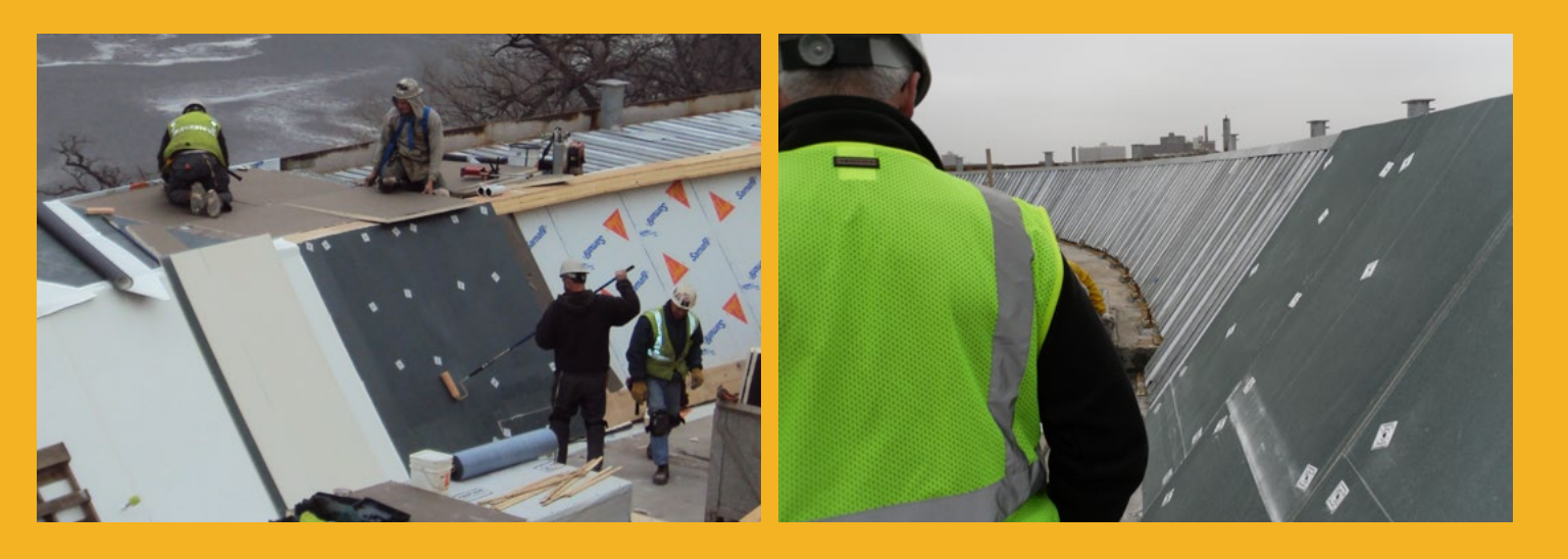
ON THE COVER: Science Teaching & Student Services Building, University of Minnesota

The company's involvement with adhered roofing systems and the technology behind them goes back more than 45 years, and this expertise has led to innovative systems and products that fully address the needs of building construction.