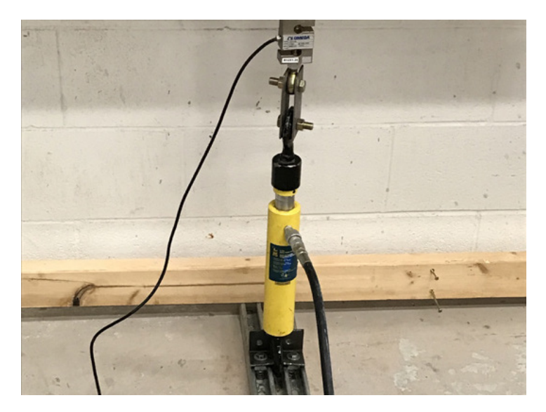
FIGURE 3 Test Set Up with Vertically Mounted Specimen