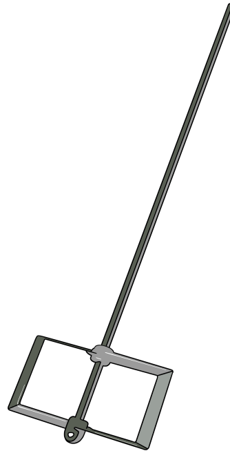
Top: Jiffy Style Paddle Bottom: Mud Mixing Paddle