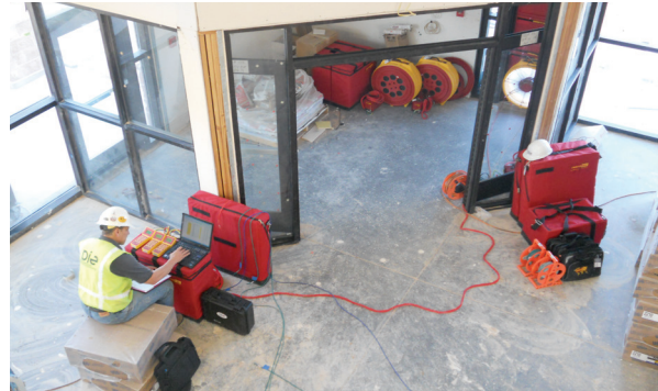
Pie Forensic Consultants observed repeatability in the test results on all 24 buildings; each passed the test the first time and with very consistent results, well under the maximum allowable leakage rates.

Eric Amhaus, a Principal with Pie Forensic Consultants stated; "Not only have all of the buildings passed with flying colors, but the repeatability of the performance testing results on this project were outstanding. The fact that the test results for all 24 UEPHs have been so close, indicates that similar results can be achieved on other buildings with like construction, materials and attention to detail in both the design and construction phases. This data can be used by the U.S. Army and/or others when evaluating design parameters & defining expected levels of performance for future buildings". Amhaus further added, "It should also not be overlooked that the 0.25 cfm/ft 2 US Army Corps requirement is approximately 38 percent tighter or more demanding than ASHRAE 189.1, which is to be adopted in the 2012 International Energy Conservation Code and sets the maximum allowable whole building leakage for commercial buildings at 0.40 cfm/ft 2 . Sundt Construction and all of the parties involved on this project should be proud of what they have achieved."