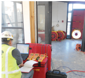
Testing was accomplished with adaptable rigid door panel frames and high powered fan systems. Based on the maximum allowable passing fan flow (CFM) for the barracks, Pie Forensic Consultants was prepared with 3 fan systems for all tests. However, due to the overall tightness of the air barrier only 1 fan system was needed to reach 75 Pa (+ and -) during testing on all buildings.

The project, which began in August 2009, consists of 24 Infantry Brigade Combat Team UEPH (unaccompanied enlisted personnel housing) barracks for the Army's 4th and 5th Brigades. Construction of this project was among the very first to fall under the new U.S. Army Corps of Engineer requirement mandating a maximum allowable envelope air leakage of 0.25 cfm/ft 2 at 75-Pa so as to reduce energy consumed by buildings on bases.