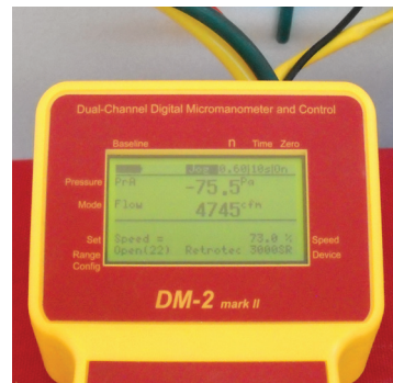
Multi-point pressure and flow readings were accomplished between 75 Pa and 40 Pa utilizing digital instrumentation per the US Army Corps protocol.

Project manager for Diversified Interiors