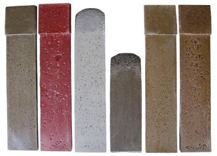
THREE RANGES OF SUPPORT (ASTM C1339)

Here are epoxy grout samples after the ASTM C1339 flow box (Master Builders Solutions sample on the far left). Notice some materials never even make it the full length of the box. Visually it is easy to see that the EBA of other materials is less than desirable.