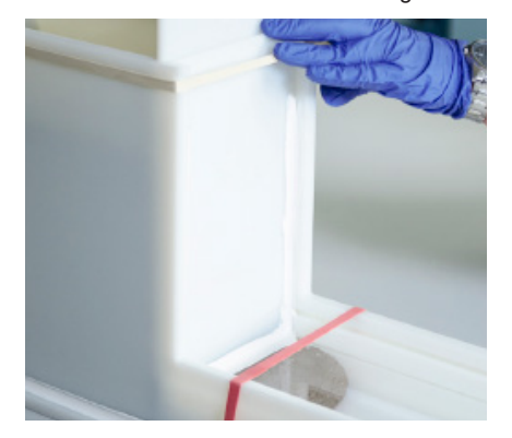
Figure 2: Material flowing through the trough