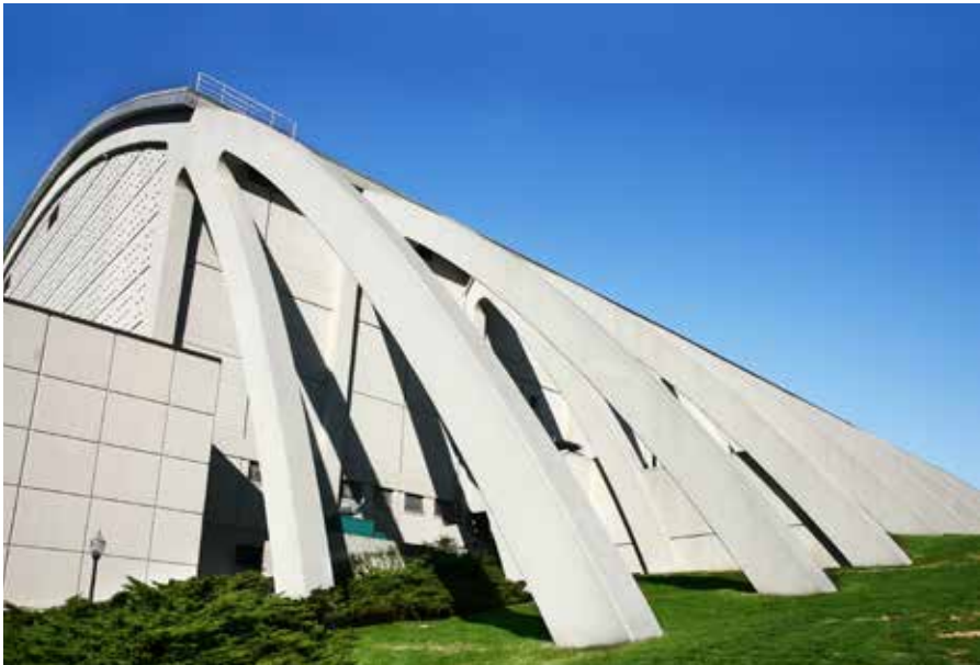
Cassel Coliseum, Lyndhurst NJ

Exterior Renovations to Cassell Coliseum Lyndhurst, New Jersey