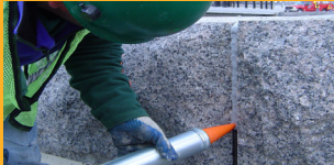
SEALING AND BONDING