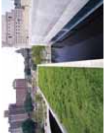
Vegetated green roofs help to minimize the burden on the environment by saving energy, reducing storm water runoff, and improving air quality. Sika has more than 35 years of green roof experience around the world.