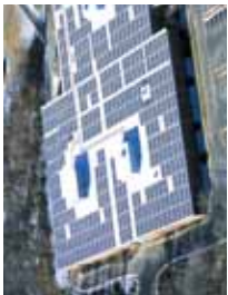
A Solar Integrated Roof produces electricity while protecting the building interior from the elements.