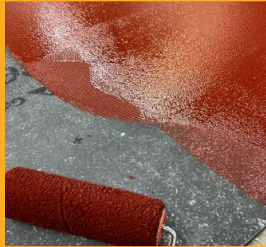
BACK ROLLED WITH 3/8" PRESATURATED NAP ROLLER