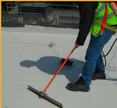
PROFESSIONAL HIGH VOLTAGE LEAK DETECTION TESTING ON DRY SUBSTRATE