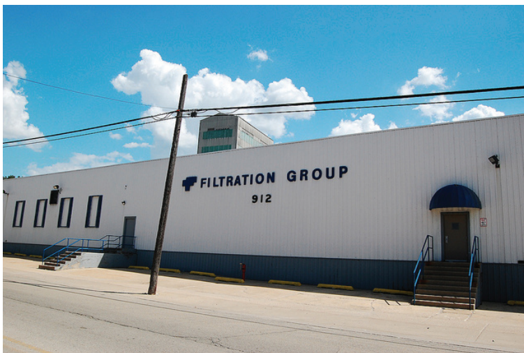
Figure 6: A thermoplastic cool roof was installed on the Filtration Group complex in Joliet, IL, in 1984 and is still in service.

Light colored thermoplastic PVC roof membranes have been in use in the USA since the 1970s. The member companies of the Vinyl Roofing