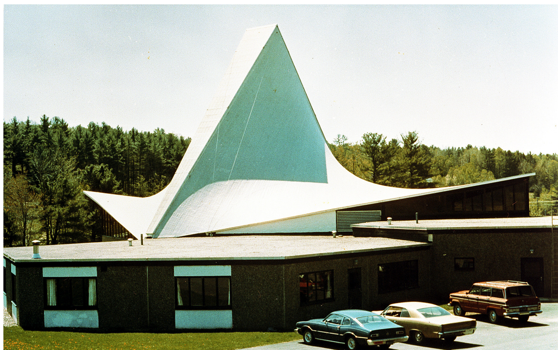
Figure 4: A thermoplastic PVC cool roof was installed on the First United Methodist Church in Gilford, New Hampshire in 1976 and is still in service today, 38 years later.

The LBNL laboratory study is a high level, macro assessment of the potential energy and environmental benefits of cool roofs across the entire USA. Engineers at the HVAC & R Center & Industrial Refrigeration Consortium at the University of Wisconsin (UW) at Madison, on the other hand, were specifically interested in the impact of cool roofs in the cities of Minneapolis, MN and Denver, CO. Their study was based on a typical “big box” retail building. They simulated different combinations of roof colors (black, white), roof insulation values (from none to R24), with and without accounting for snow cover.