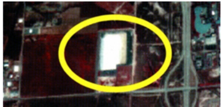
Figure 1: R.C. Wiley Furniture warehouse in Salt Lake City is clearly visible in this aerial photograph.

Although some of the "cool" roof membranes remain largely unchanged from their earliest days, the recognition of the potential benefits of such materials has grown dramatically since the late 1990s. Newsweek magazine first highlighted the benefits of cool roofs in their Millennium Notebook in November, 1998. The article featured the R.C. Wiley