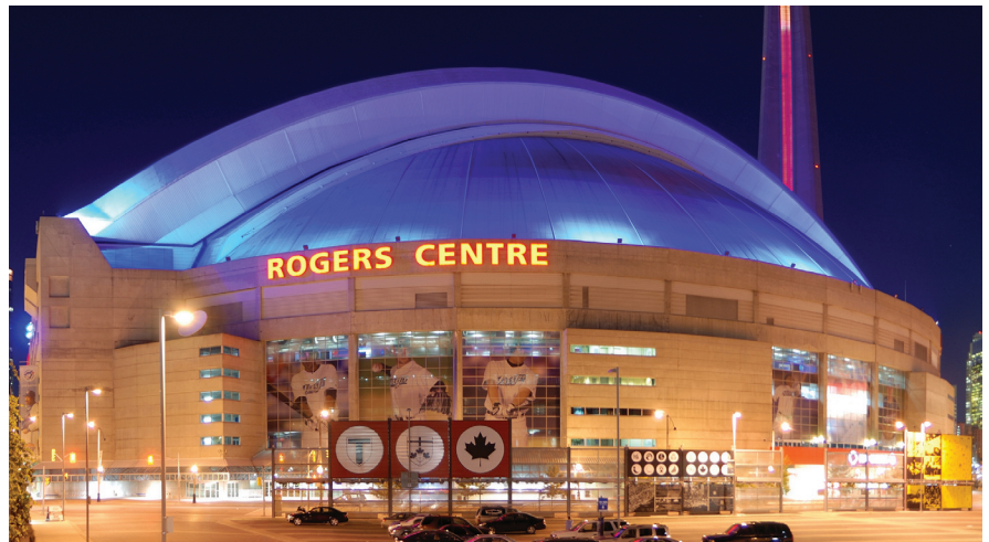
Figure 5: The Rogers Centre in Toronto, aka Skydome, was constructed in the mid-1980s and relied on 350,000 sq. ft. of thermoplastic PVC “cool roof” still in place today.

As noted previously, the vast amount of urban surfaces covered by asphalt parking lots and roads, dark colored roofs and other building surfaces collectively absorb significant amounts of the energy radiating from the sun, thereby increasing the overall ambient temperature. The UHIE increases smog formation, which is compounded by the increased greenhouse gas emissions resulting from the power generation required