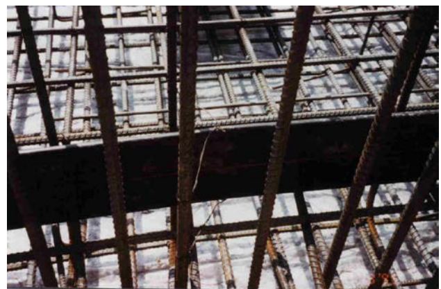
Stabilize waterstop using tie wire through pre-punched