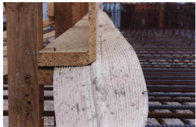
Note alignment of waterstop centerline with joint

This is accomplished with grommets, which are be factory applied to the waterstop at the outermost rib on 12" centers. Tie wire is looped through the grommet and tied off to adjacent reinforcement (Image 2). This adequately secures the waterstop to prevent any displacement or "folding over" of the waterstop during the concrete pour. Never place nails or screws through the body of the waterstop. It is important to note the thicker waterstops are less likely to fold over. Thicker waterstops also reduce the potential for the grommets to tear out of the waterstop due to the stresses caused during concrete placement.