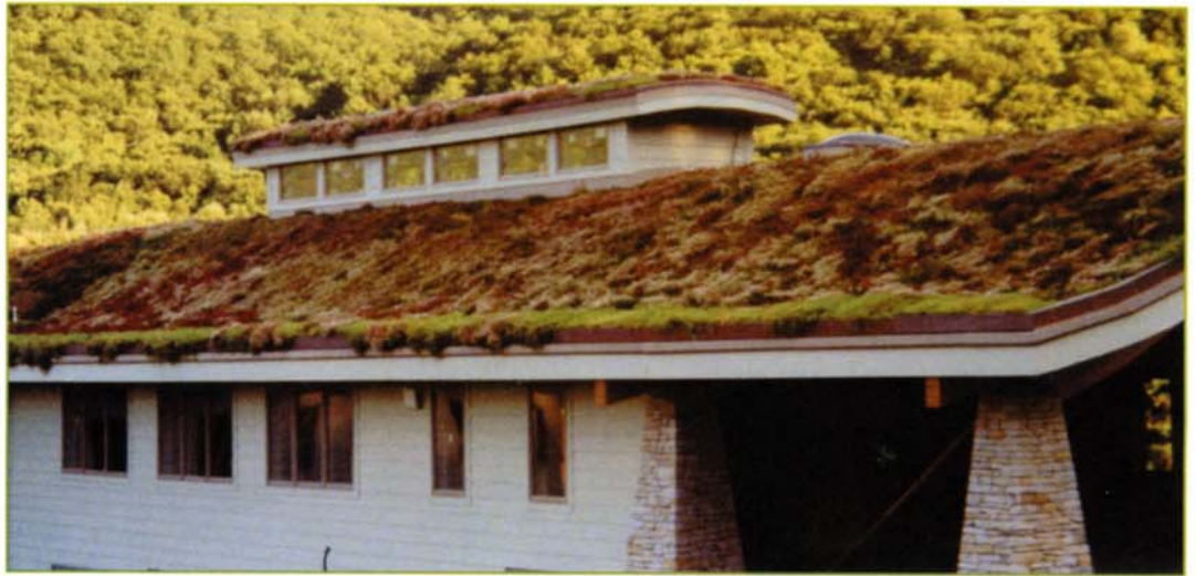
Photo 5: Hazelton Chiropractic Center, Hazelton, PA. Architect: Van De Ruyn, San Francisco, CA. Vegetative cover by Roofscapes.

gress made in reducing the installed system cost on an average-sized roofing project to about $12 per square foot for an extensive system with limited plant selection and thin soil base. With all the positive attributes, the number, size, and frequency of green roofs should increase as the system unit cost declines (Photo 5).