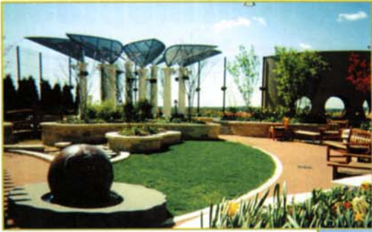
Left: Photo 2. Olson Gardens, St. Louis Children's Hospital.