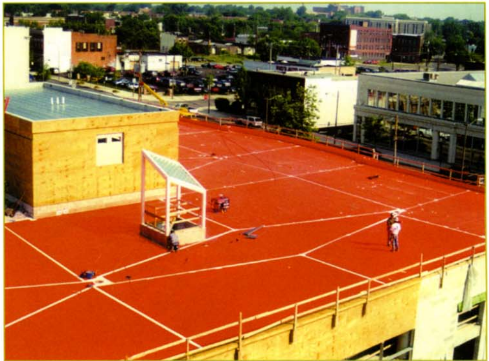
Photo 4: Lucas County Public Library, Toledo, Ohio.

In Germany, green roof membrane products must be tested by the FLL (Forschungsgesellschaft Landschaftsentwicklung Landschaftsbau of Essen, or Research Association for Landscape Development and Construction) for resistance to root penetration. The FLL test procedure is considered by many as the most stringent and meaningful green roof membrane test worldwide. To fulfill the test requirements, roofing and waterproofing membranes must "permanently prevent penetration and/or puncturing by roots on flat roofing, in corners and along seams." The FLL test is