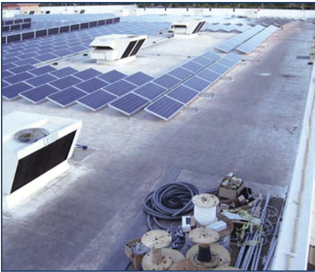
Photo 1 – New TPO roof damaged during PV installation.

been occurring and witnessed by roofing professionals in recent years, solar integrators, electricians, and others are installing PV systems with little or no consideration for the roof platform on which they are working.