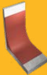
Ucrete RG Integrated Cove Base

Heavy Duty, Slightly Textured. Trowel applied cementitious urethane floor resurfacer (250 to 375 mils) with slightly textured slip resistant finish for medium to heavy-duty use.