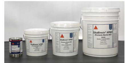
SikaBiresin® AP861 Part A resin packaging