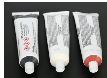
Sika offers BPO cream hardeners in black, white, and red in 1-ounce and 4-ounce tubes.