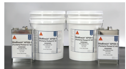
SikaBiresin® AP100-1 and AP100-3 Part B hardener packaging