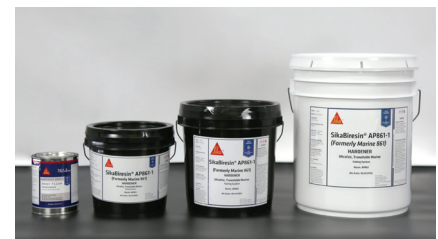
SikaBiresin® AP861-1 Part B hardener packaging