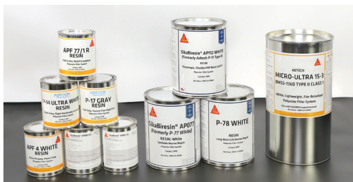
Sika's polyester filling and fairing resin components are packaged conveniently in quart, gallon, and 3-gallon containers.

Sika's polyester filling and fairing compounds are two-component systems, consisting of a polyester resin and benzoyl peroxide (BPO) cream hardener. They are excellent for everyday filling and fairing applications, providing fast sanding times, with select technologies offering high temperature resistance, flame retardancy, or below waterline capability. All polyester filling and fairing compounds are mixed 100 parts by weight of resin with 2 parts BPO.