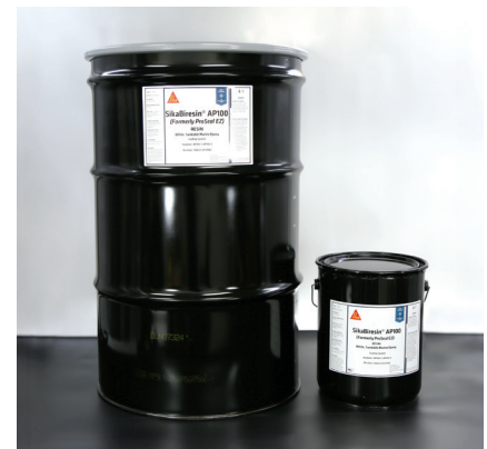
SikaBiresin® AP100 Part A resin packaging

(B) Tests with actual materials and conditions have to be performed to ensure satisfactory performance. Substrates must be roughened and cleaned prior to use to promote adhesion. All technical data stated in this table is based on laboratory tests. Actual measured data may vary due to circumstances beyond our control.