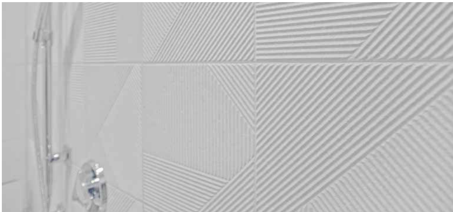
SikaTile®-500 LHT Lite bonds Kertiles Verse Concept tile in the men's locker room shower.

With the tile and planks installed, Zaharion's crews applied two of Sika's maintenance-free grouts to bring the hard-surfaces portion of the project to a close. High-performance SikaTile®-815 Secure Grout finished off the clubhouse's vertical surfaces with hard, efflorescence-free joints. The