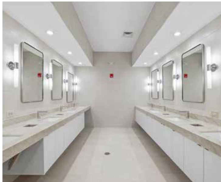
Zaharion's used SikaTile®-475 LHT Premium Set throughout the clubhouse's floors.

"SikaTile®-475 [LHT Premium Set] we used for the lobby for adhesion pur-