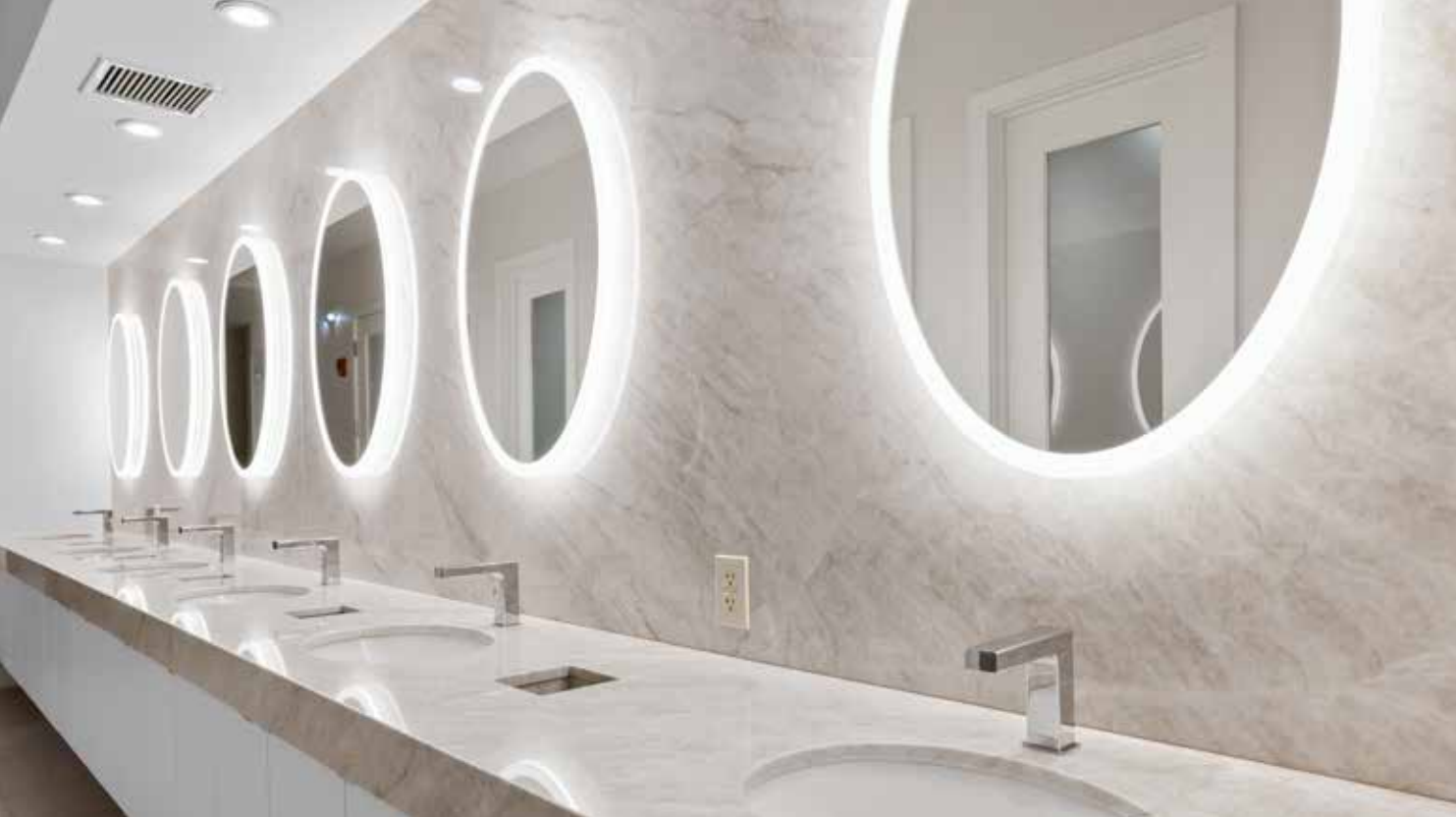
Zaharion's used SikaTile®-500 LHT Lite on the women's restroom's porcelain slabs.