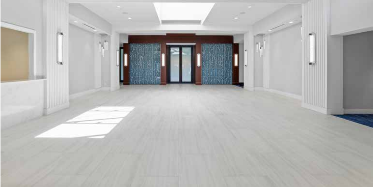
SikaTile®-200 Fracture Guard Rapid prevents cracks from damaging the new clubhouse floors.

“BY FAILING TO PREPARE you are preparing to fail.”