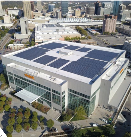
1 TD Garden – Boston, Massachusetts 2 Vivint Smart Home Arena – Salt Lake City, Utah