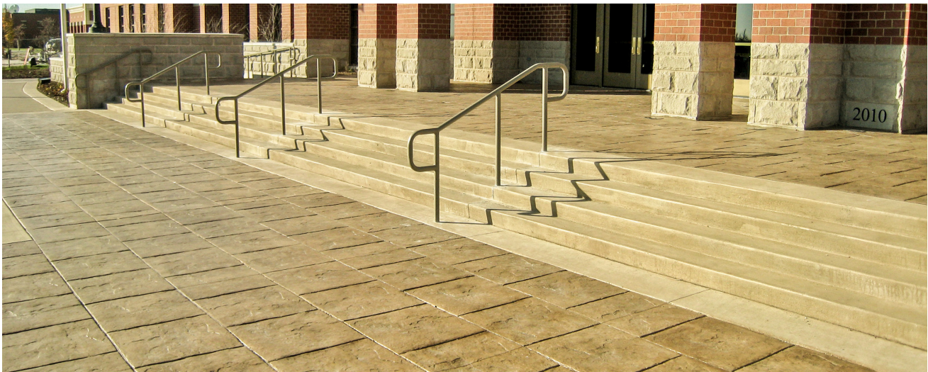
CLASSIC STONE PATTERN using Perma-Cast® Stamping Tools "24" x 24" Bluestone", colored here with Uni-Mix® Integral Concrete Colorant in "Harvest Wheat", and accented with Perma-Cast® Antiquing Release in "Colina Tan".