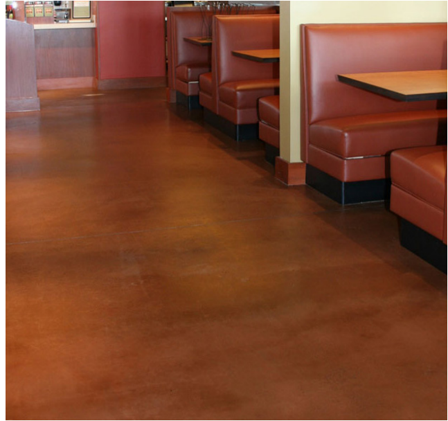
GO ROMA The owners of this restaurant were looking for a classic Italian look in a challenging environment. Perma-Shake® Color Hardener in "Terra Cotta", "Chestnut" and "Colina Tan" provided exactly the floor they were looking for.