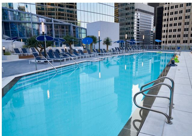
WILSHIRE GRAND At 73 stories, the Wilshire Grand Center is the tallest building in America west of the Mississippi River. Over 12,000 sf of decorative concrete using LITHOCHROME® Color Hardener in “Deep Charcoal” & “Stone Gray” were used as selected by the architect.