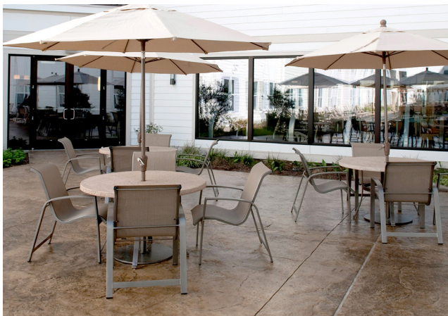
201 COURTYARD The restoration of this hotel courtyard was completed using LITHOTEX® Pavecrafters® texture mats in “Fractured Earth” texture. LITHOCHROME® Antiquing Release Pro in “Walnut” completed the look.