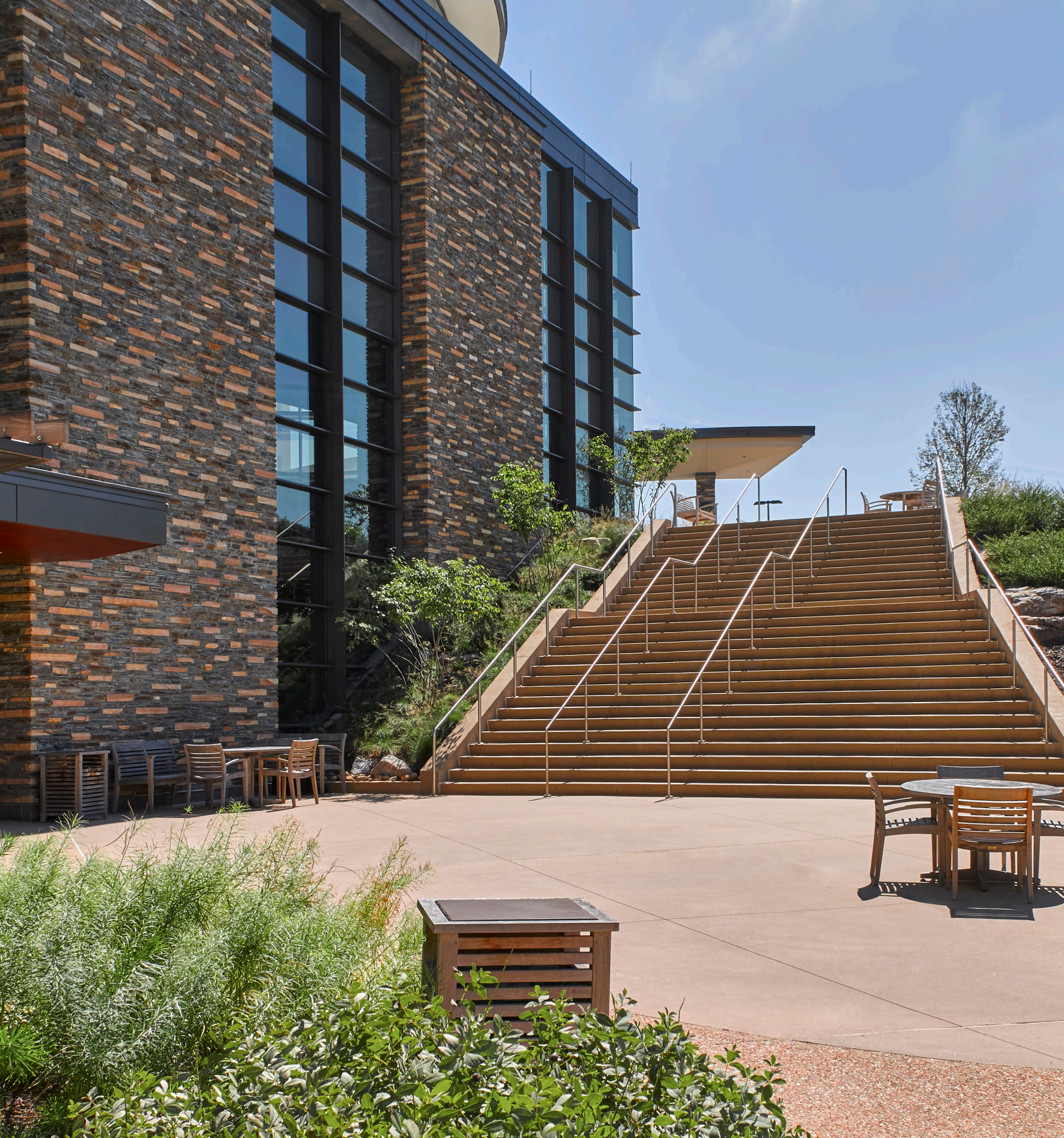
NE GEORGIA MEDICAL CENTER The concrete stairs and pad were colored with CHROMIX® Admixtures in "Cox Beige", with LITHOCAST™ Surface Retarder 03 applied for an acid etched exposed aggregate finish. SCOFIELD® Cureseal-W™ was applied the following day. Both treads and risers are exposed.