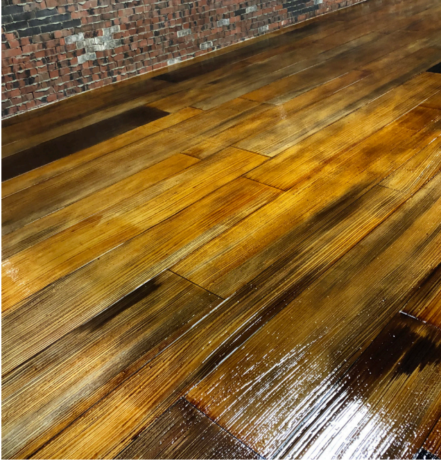
SOLVENT-BASED SEALERS deliver excellent protection while enriching the color of concrete.