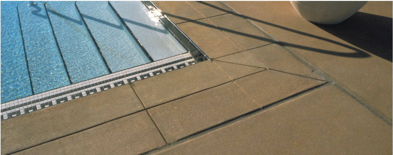
CONCRETE CURING COMPOUNDS AND CURE/SEALERS aid in the development of the designed concrete strength. They retain water in the concrete to promote proper cement hydration. The use of cures and sealers can help minimize unwanted cracking, such as surface cracking and shrinkage cracking, and allow for the maximum potential of abrasion resistance of the concrete.