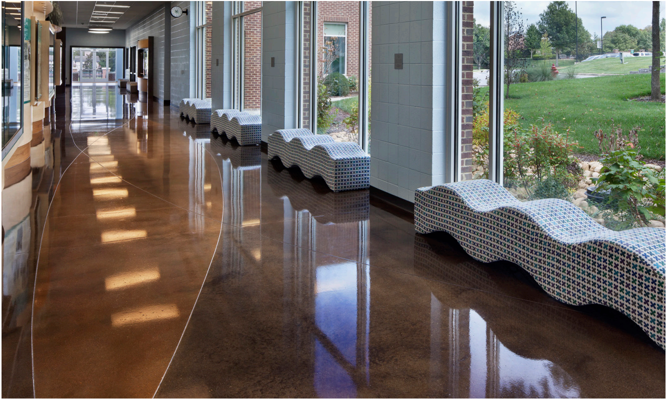
HARPETH HALL ATHLETIC CENTER A high-traffic space needed a durable, low maintenance, attractive concrete color solution. Unique, fluid lines draw the eye down this corridor using alternating bands of LITHOCHROME® Chemstain® Classic in "Padre Brown" and "Dark Walnut".