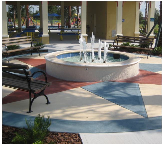
CENTRAL PARK In addition to its long-wearing characteristics, concrete color hardener is widely used for its vibrant colors on the surface of the concrete slab. This star pattern was created using LITHOCHROME® Color Hardener in "Blue Smoke", "Burberry Beige" and "Dark Red".