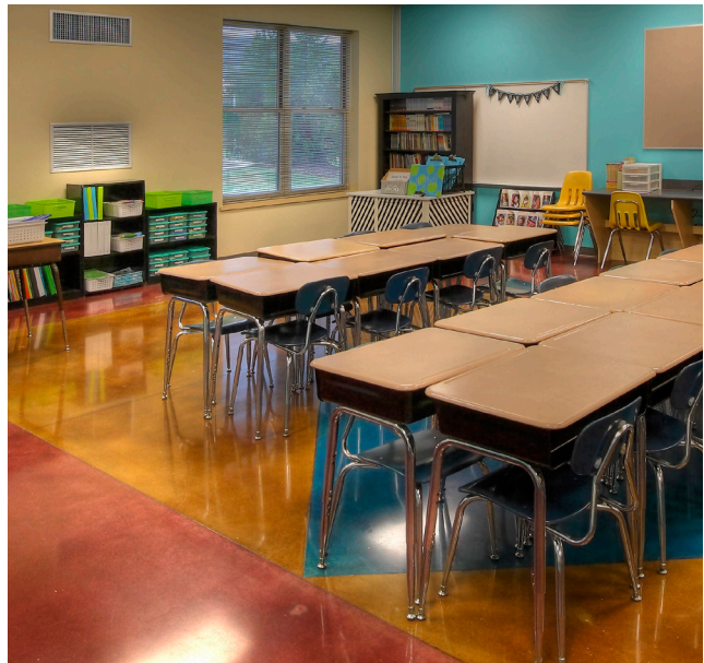
LEBANON ELEMENTARY The vibrant colors of Sika® Formula One™ Liquid Dye Concentrate in "Bahama Blue", "Ponderosa", and "Aztec Red" made learning fun and maintenance a breeze at this elementary school.