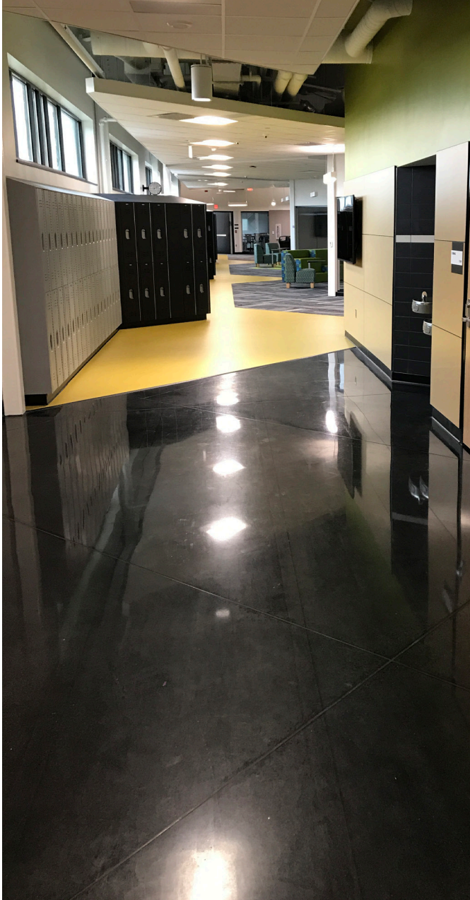
PERRYSBURG SCHOOL One of the most requested color choices, the stain-resistant black floor for the cafeteria and hallways of this intermediate school were achieved using Sika® Formula One™ Lithium Densifier MP, Sika® Formula One™ Guard-W and Sika® Formula One™ Liquid Dye Concentrate in "Black".