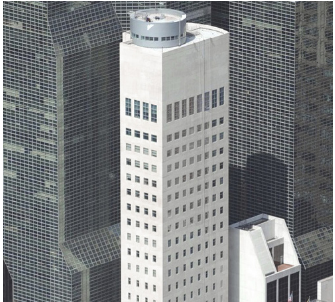
U.N. MISSION BUILDING Designed by renowned architects Gwathmey Siegel & Associates Architects, the CIM award-winning United States Mission to the United Nations uses classic geometric shapes in a contrasting color to contrast with the buildings surrounding it. The cast-in-place concrete was colored with CHROMIX® Admixtures for Color-Conditioned® Concrete in "Mission Gray".