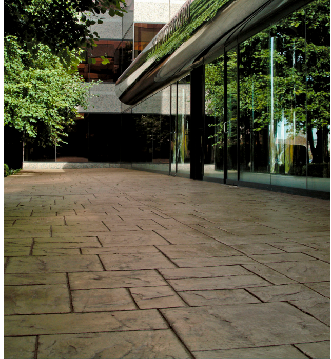
STYLISH SLATE PATTERN using Perma-Cast® Stamping Tools "Majestic Ashlar", colored here with Uni-Mix® Integral Concrete Colorant in "Lanon Stone", and accented with Perma-Cast® Antiquing Release in "Storm Gray".