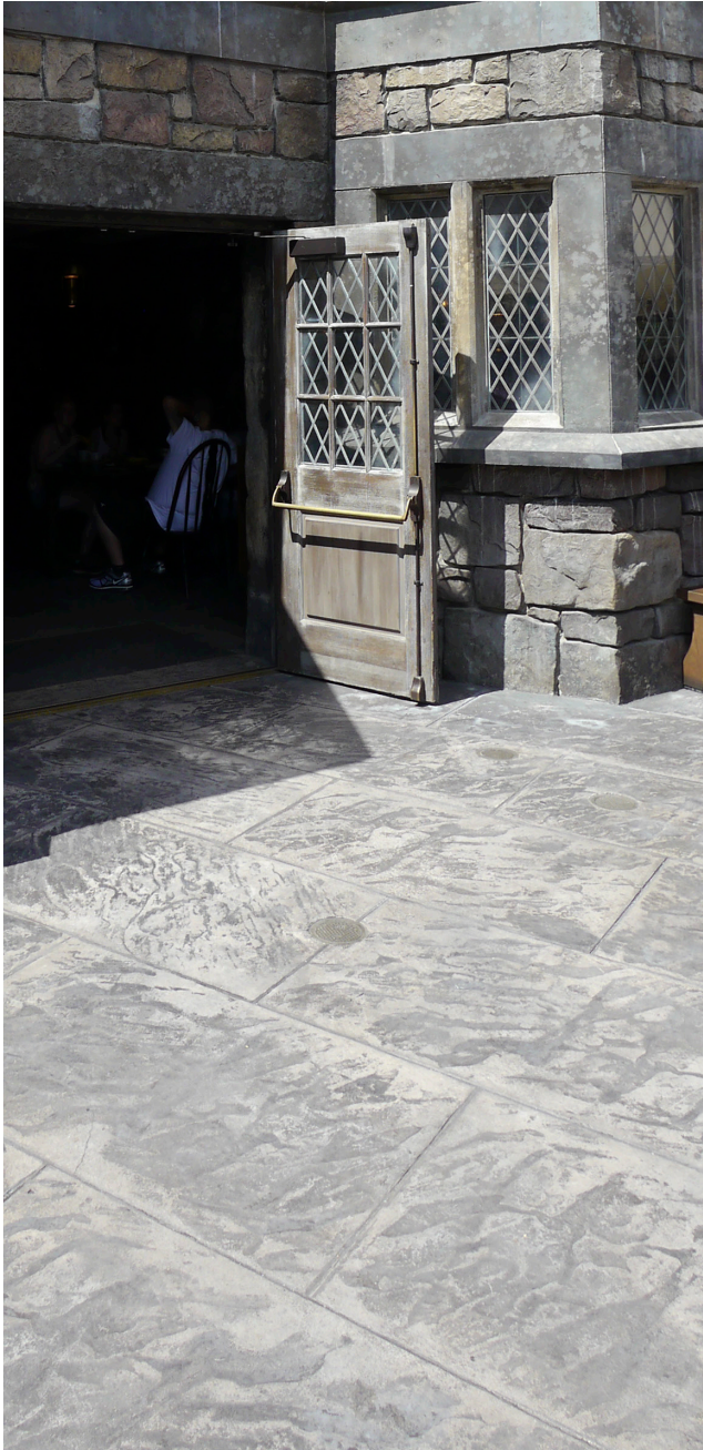
THEME PARK When combined with Sika® Stamps and Antiquing Release, concrete color hardener provides the most realistic imprinted concrete surfaces. LITHOCHROME® Color Hardener in "Ash White" with "Landmarks Gray" release.