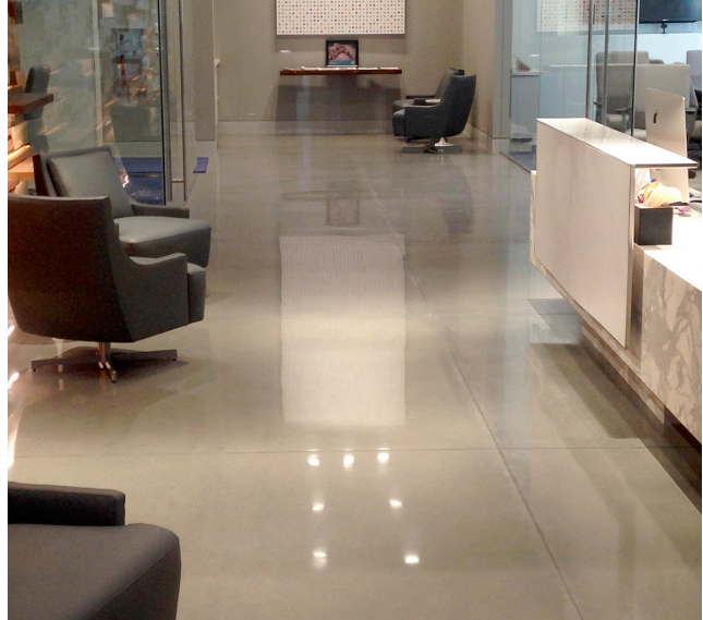
ALEXANDRIA CENTER A smooth, consistent gray finish for their office floors was requested by this client. Their vision was achieved using Sika® Formula One™ Lithium Densifier MP, Sika® Formula One™ Finish Coat and Sika® Formula One™ Liquid Dye Concentrate in "Concrete Gray".