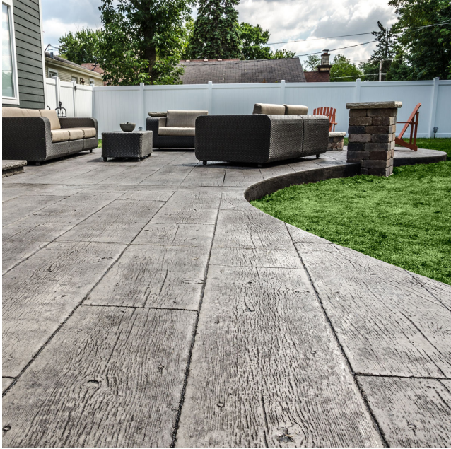
RUSTIC WOOD PATTERN using Perma-Cast® Stamping Tools "Gilpin's Falls Bridge Plank", colored here with Uni-Mix® Integral Concrete Colorant in "Gull Gray", and accented with Perma-Cast® Antiquing Release in "Deep Charcoal".