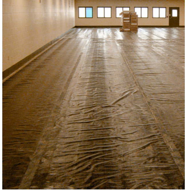
PROGUARD™ DURACOVER™ provides protection from construction traffic, equipment, gypsum wall board, dust and other construction related materials. It resists oil and petroleum-based compounds and high pH compounds, and will not scratch wood, ceramic tile, or other finished floor systems.