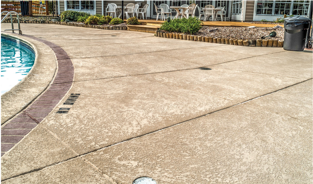
POOL DECK A knockdown finish on T1000® Fine Overlay in “Lanon Stone” color provided the perfect texture solution to this upscale apartment pool deck area. The knockdown finish can provide a natural measure of slip resistance.