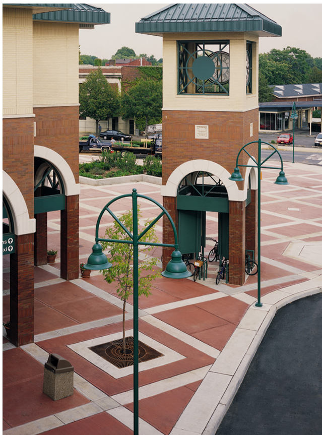
RAHWAY STATION This high-traffic rail station occupies a strategic location close to NYC. Durable, abrasion-resistant LITHOCHROME® Color Hardener was utilized in “Dark Red” and “Ash White” to create a simple, yet bold hardscape pattern.

Color hardener is a common product choice for stamped concrete. Used in conjunction with a colored release and or antiquing agents, color hardener will provide a durable, realistic patterned and textured surface.