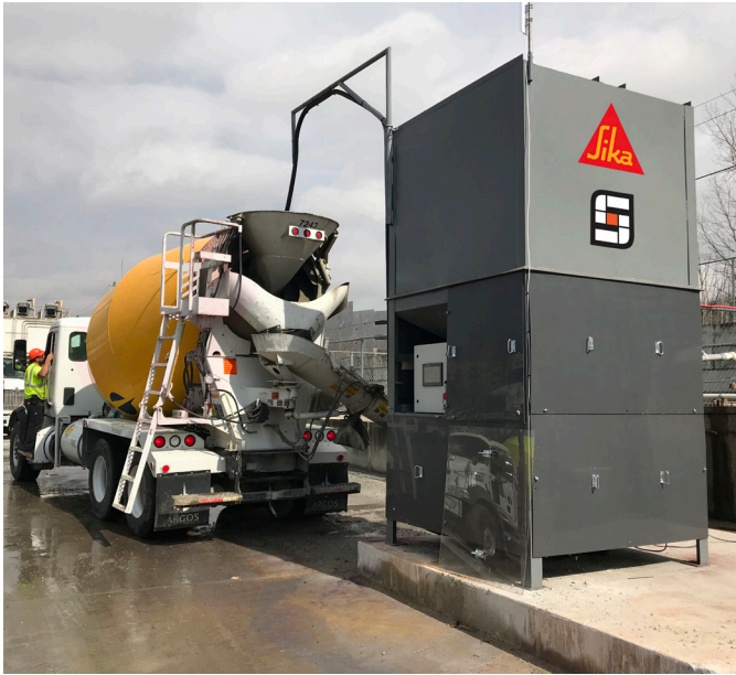
SIKA INTEGRAL COLOR is available at select distributor and ready mix locations nationwide through our network of Granular Color Dispensers, or in ready-to-use, premeasured disintegrating bags.