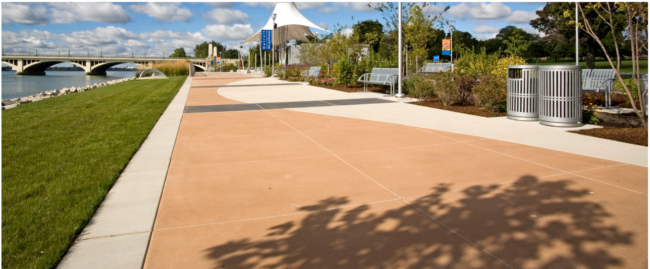
DETROIT RIVERWALK Spanning more than three miles, the Detroit International RiverWalk is the crown jewel in the downtown Detroit revitalization effort. Several colors of CHROMIX® Admixtures were used to create visual interest and integration with surrounding elements, including "Charcoal", "Sombrero Buff" and "Adobe Tan".