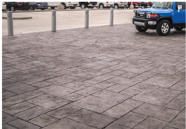
MAJESTIC TOYOTA T1000® Stampable Overlay in “Lanon Stone” was used to resurface this car dealership entrance area, with Perma-Cast® Stamping Tool “Majestic Ashlar”.