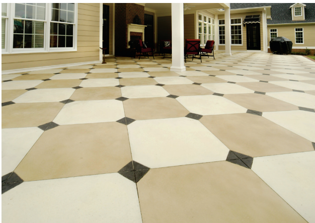
CHECKERBOARD PATIO The formal elegance displayed in this large, high-end outdoor patio was realized with sawcut and stained decorative concrete using LITHOCHROME® Tintura™ Stain in "Wheat Grain" and "Black".