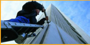
SEALING AND BONDING