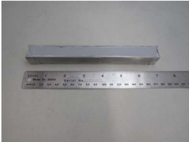
Photo Documentation – The product sample specimen is photographed immediately following specimen preparation and prior to initiating the conditioning period. Typically, the top and bottom faces of the specimen are photographed. Bottom faces may show a stainless-steel plate or other substrate if prescribed by the standard.