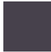
C-34 Dark Gray