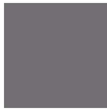
C-284 Landmarks Gray