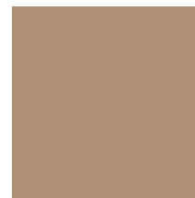
C-15 Coachella Sand