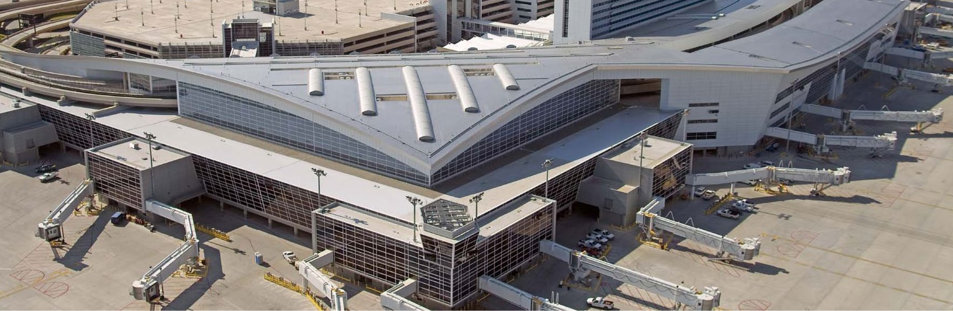
▲ Dallas/Fort Worth International Airport, Dallas, TX